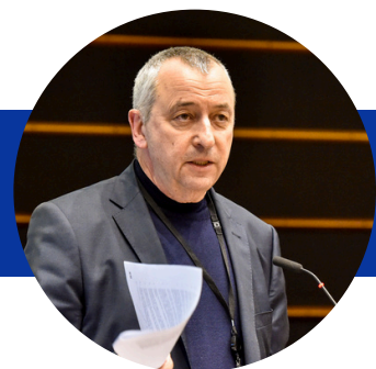
Georgi PIRINSKI (S&D 2014-2019, Bulgaria)

He first worked for the Food and Agricultural Organisation of the United Nations in Kenya from 1970 to 1975. From 1975 to 1976, he was a Policy Officer at the Directorate-General for International Cooperation in The Hague, Netherlands. He also worked 18 years for the European Commission where he was responsible for developing and implementing Agricultural Development projects.